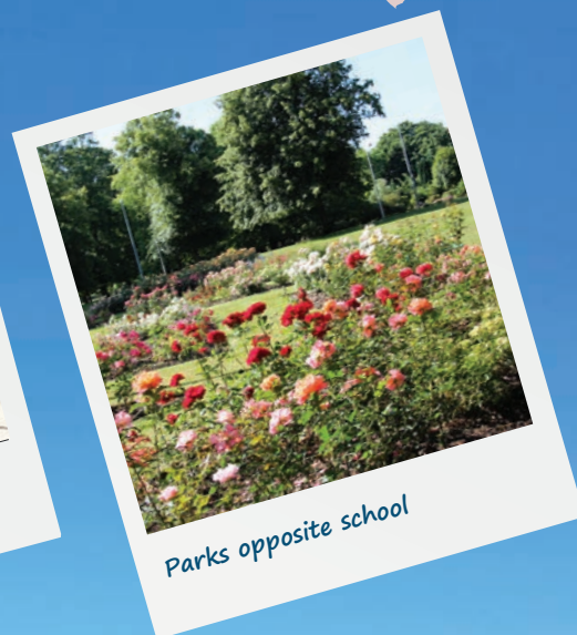
Parks opposite school