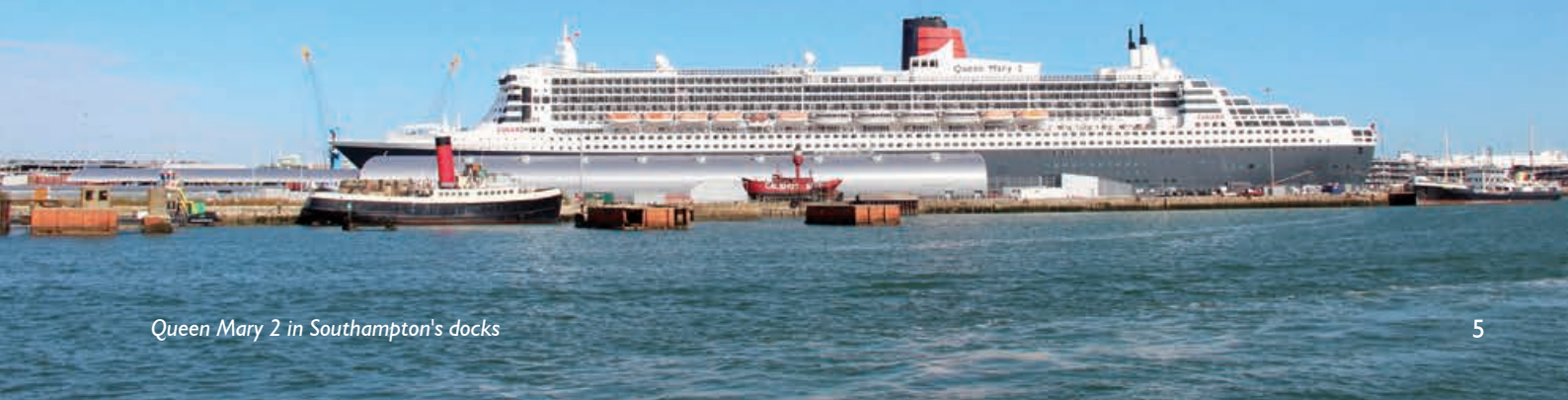
Queen Mary 2 in Southampton's docks