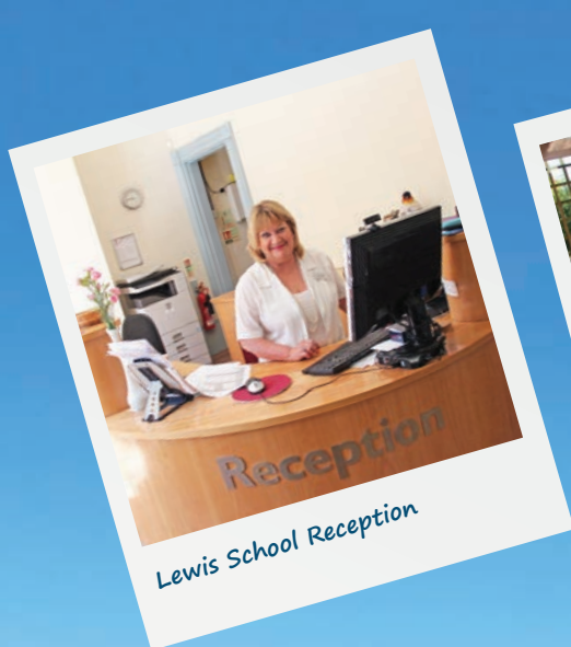
Lewis School Reception