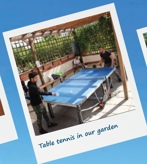
Table tennis in our garden