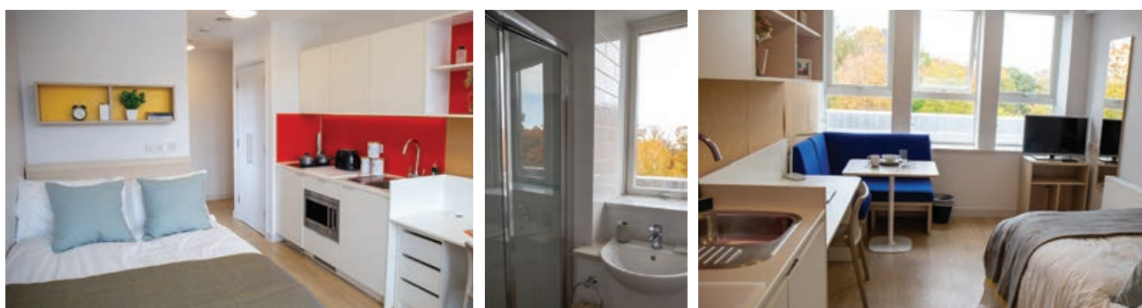
Photos show accommodation at one of the residences we work with