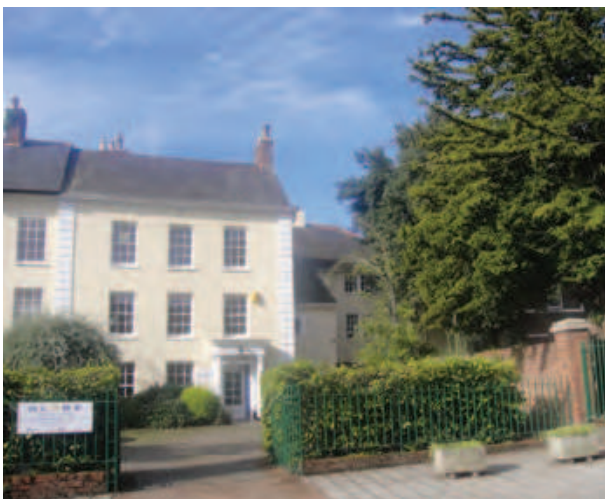
The Globe Reception